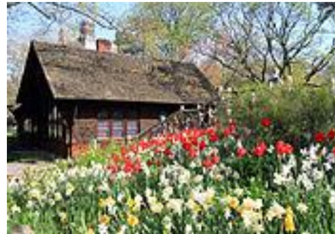
The Central Park after the twilight Shakespeare's Garden